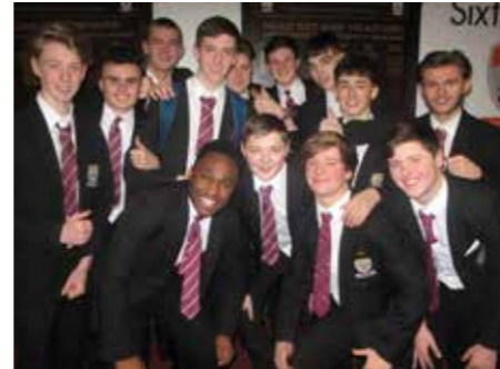
The Good Samaritans

It is always wonderful to hear good news about students that attend Cardinal Hume Catholic School, but the greatest news to hear is when students do something that makes your heart swell with pride while not directly under school supervision. An act so unselfish and caring that it motivates others to go out of their way and contact the school to tell you how wonderful your pupils are. Indeed it raises your eyes heavenwards in thanks and hope.