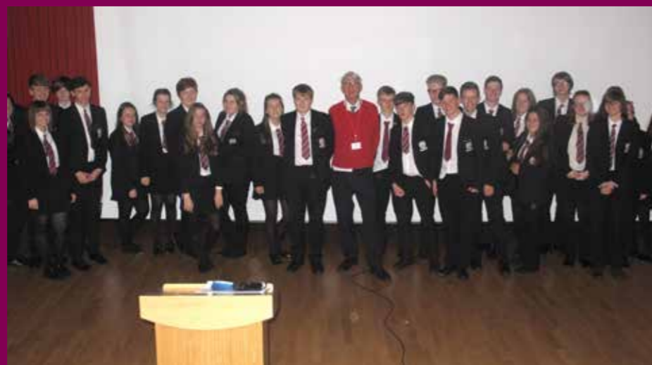
Students inspired by Philosophy