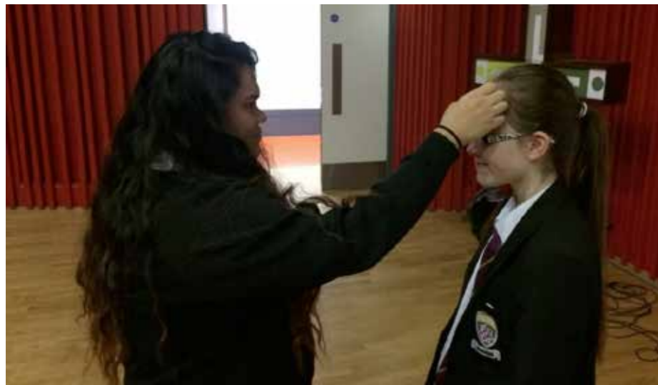
Students distribute ashes