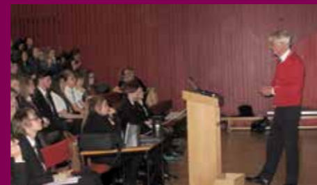
Top Philosopher engages students

subject, underpins all modes of thought, political structure and religious belief that exist and have existed in the world. An A-level in Religious Studies is not only a subject that can help you on the path to studying Law, Medicine, Ethical Business, Teaching, Social Work and the Police, but has real value in helping us to understand our purpose on this world and what will truly make us happy. Now how to be truly happy, that really is worth finding out!