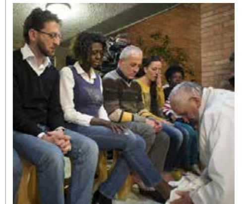
Pope Francis washes inmates' feet